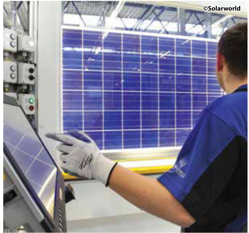
Solar glass not only protects the shimmering blue solar cells against detrimental influences but also helps to "catch" as much sunlight as possible

Until such novel technologies as smart solar glass can be used on a commercial scale, the industry will implement more obvious innovations. For instance, since last year, in a joint venture with Interpane and the Dutch company Scheuten the German solar glass manufacturer F-Solar has offered float glass that is half the thickness of conventional solar glass: two millimeters. "The reduced material input brings down the price. Further-