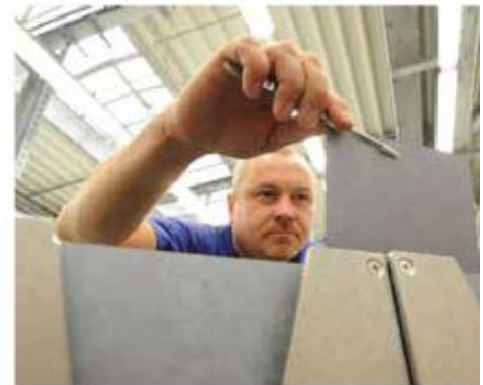
Quality control: crystalline silicon cells are becoming ever cheaper. One reason for this is the improved properties of cell blanks, the so-called wafers.