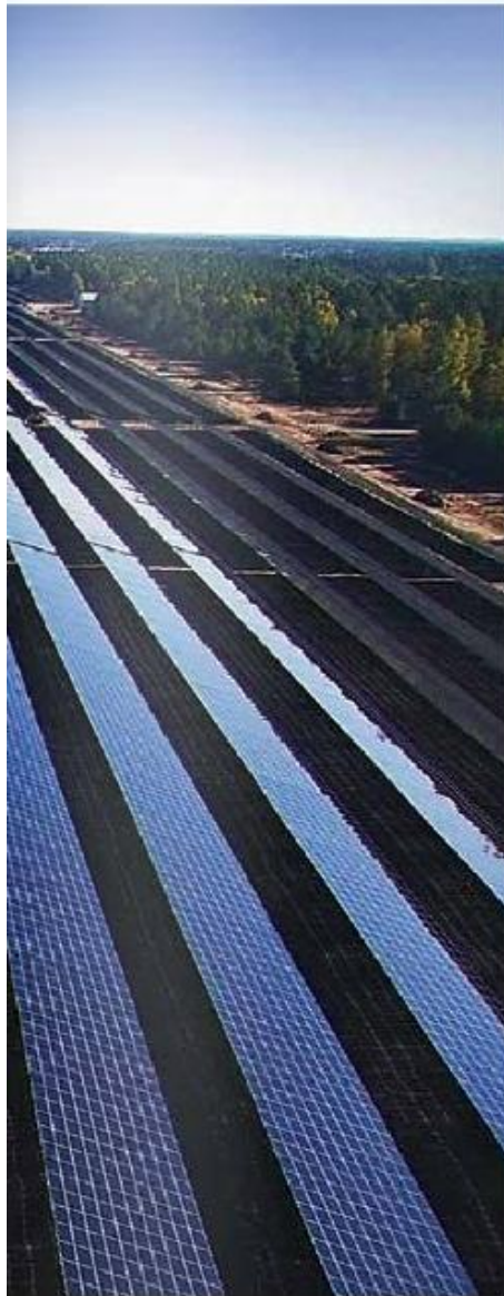
▲ Thin-layer in rows: solar project developer Belectric has built Europe's biggest photovoltaics power plant in Eastern Europe using cadmium-telluride modules by First Solar.

The crisis of the photovoltaic industry is drawing to a close. While it is true demand for solar modules is dropping in Europe, demand in many other regions is rising rapidly. Even the producers of thin-layer modules which we had been almost "written off" are investing in new factories again. This is good news for the producers of solar glass and production equipment.